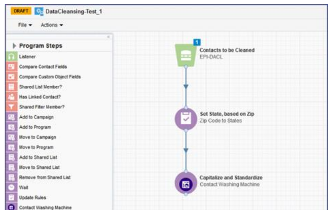
Created, Configured, and Managed using Program Canvas