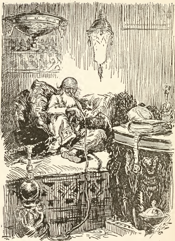
Shiraz the Rug-Merchant looked at his visitors with little beady black eyes.