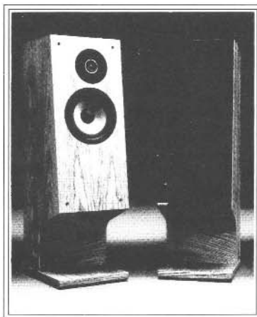
ENERGY 22 REFERENCE CONNOISSEUR