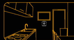
In your kitchen...