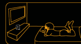
In your bedroom...