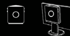
Wall mount or LCD mount

ZOTAC ZBOX can also be mounted using the bundled VESA mount.