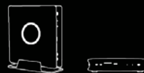
Stand Upright or Lay Flat

ZOTAC ZBOX can be a stand-alone miniature solution.