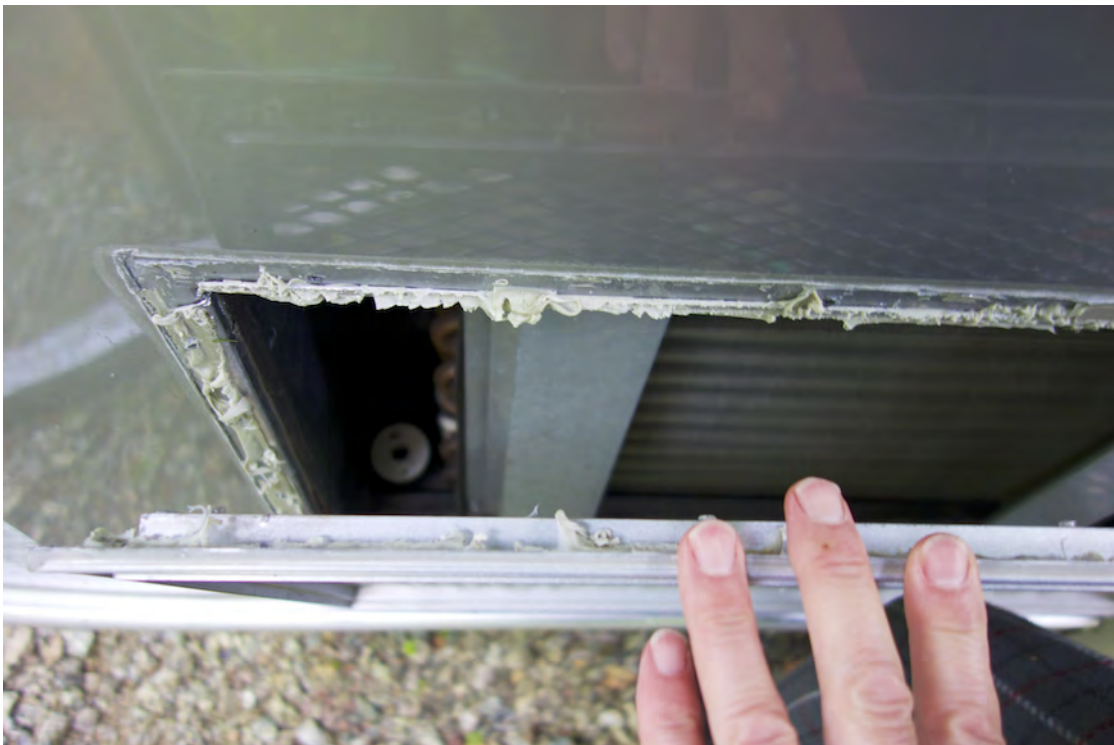
Removing outside grill - the hardest part. Cut caulking with utility knife about 4 times. Hammer putty knife in crack every inch, and try to pry the gooey mess off without bending the grill or scratching the paint.