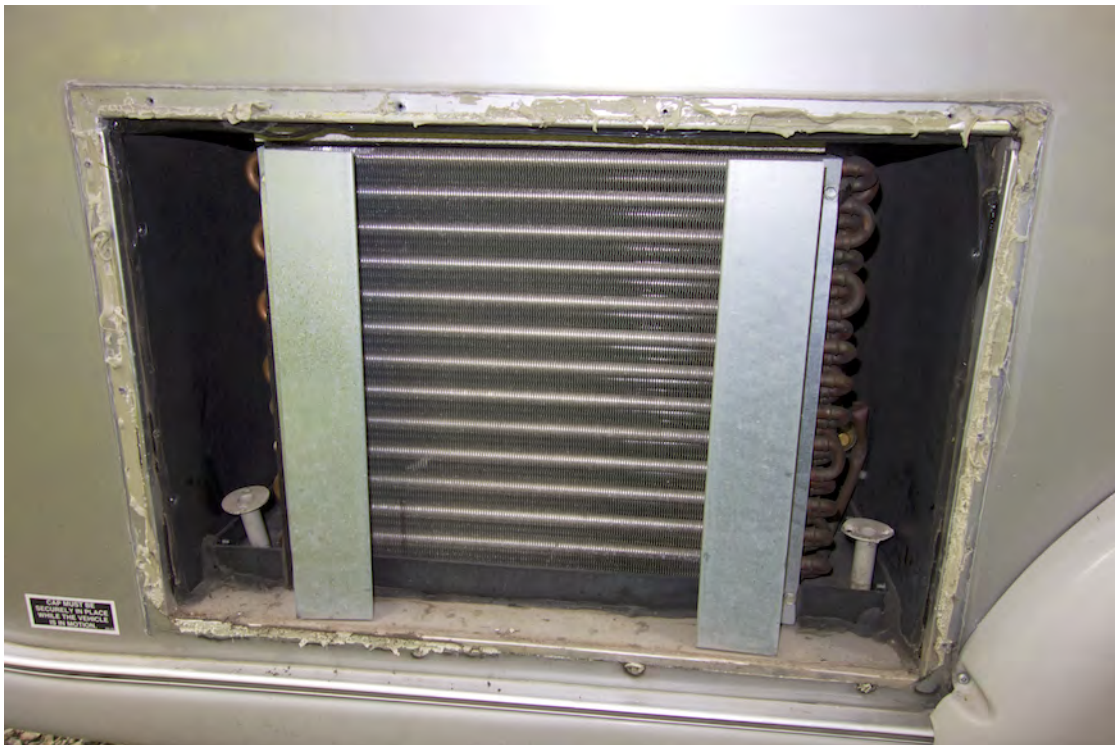
Outside view with drains partially removed.

Don't forget to remove drains - or the CoolCat will not slide out. Drains are removed by removed 2 screws each and hammering the underside of the drain while avoiding thumbs and other T@B parts.