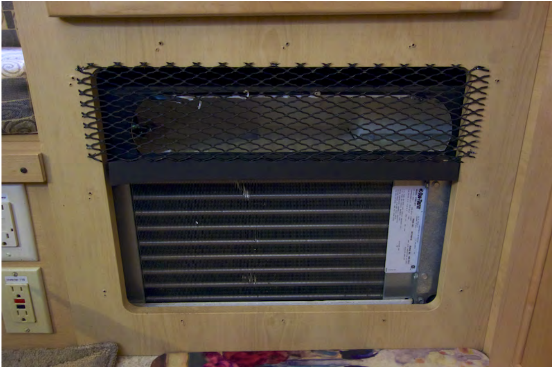
Inside grill removed. Easy so far.