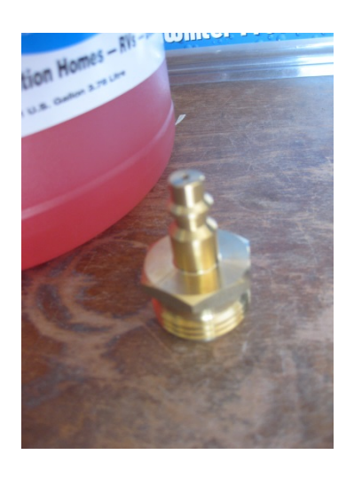
This is a "blow out" plug that fits into your city water connection, then connects to a standard air compressor hose... KEEP THE PRESSURE WELL