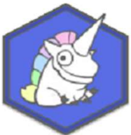
6. Mad Dog's Union Yard Rainbow horse's favorite.