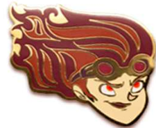
8. Tito's Restaurant Jalapeno Margarita Might as well get nachos, too.