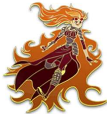
5. Rosario's Pica Pica Cucumber & jalapeno.