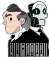
7. Ocho Havana Margarita Swanky margarita digs.