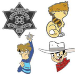
4. Barriba Cantina El Jefe Grande Bring friends - 28oz